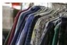
Clothes & Accessories