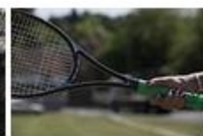
Health, Fitness & Beauty