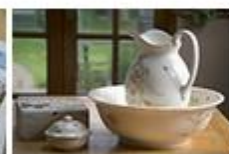
Gifts, Home & Garden