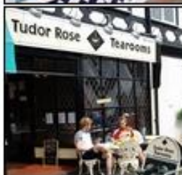
Tudor Rose Restaurant 8 The Green Westerham Kent TN16 1AS Tel: 01959 582391 Tea shop offering freshly cooked breakfast, lunch and delicious teas with cakes and scones