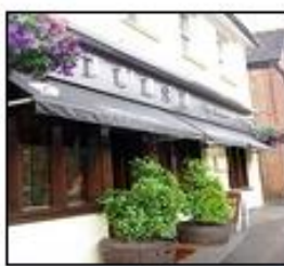
Tulsi Indian Restaurant 20 London Road Westerham Kent TN16 1BD- Tel: 01959 583397 Customers come from a very wide area to dine where they know the standard of food and the service provided is always superb.