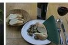
Eating & Drinking