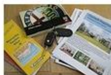
Agents & Services