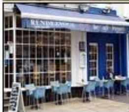
Rendezvous Café Brasserie 26 Market Square Westerham Kent TN16 1AR Tel: 01959 5861408

Rendezvous represents a true taste of the authentic Café-Brasserie style at its best, offering a vibrant yet relaxed atmosphere and our food produce is brought fresh from market (naturally unprocessed)