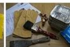
Trades, Resources, Suppliers