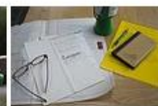
Legal Financial & Charity